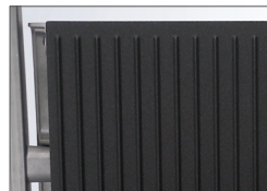
Ribbed top plate Teflon® coated*