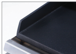
Smooth plate Teflon® coated*